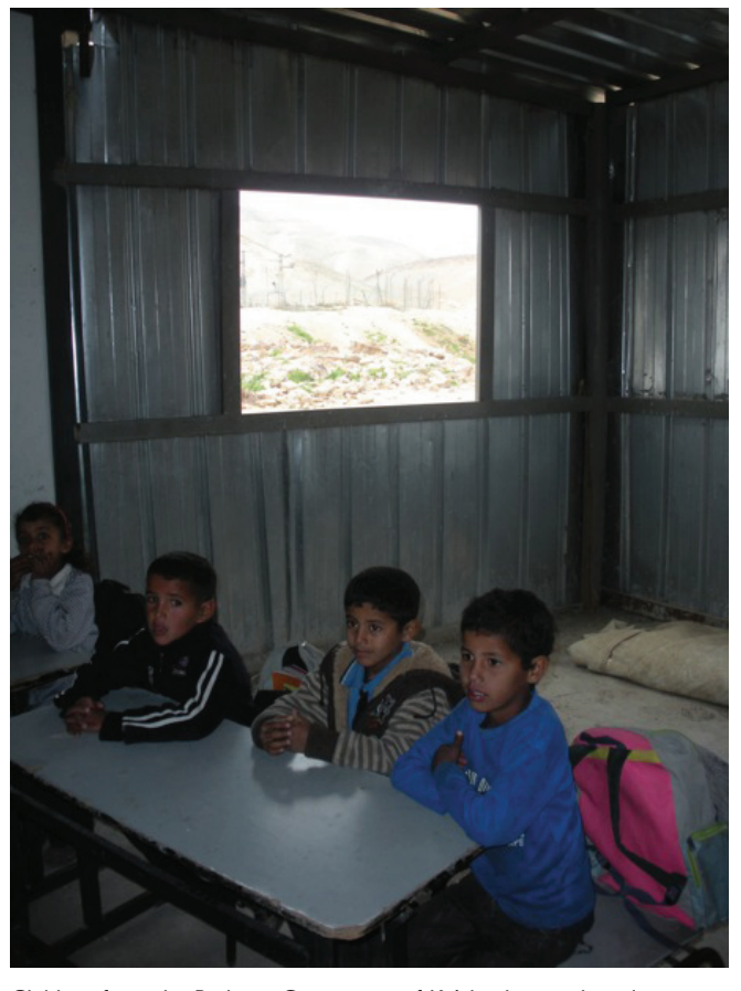
Children from the Bedouin Community of Ka'abneh attending classes in a school slated for demolition.

In Area C of the West Bank, the right to education of Palestinian children continued to be undermined by demolitions and demolition orders. On 10 January, Israeli authorities demolished the primary school in the Palestinian community of Khirbet Tana (see displacement section); this school had been previously demolished in 2005 and subsequently rebuilt. Also this month, the ICA issued renewed demolition orders against the school serving the Al Ka'abneh Bedouin community in Jericho district, due to the lack of building permits. The school, which provides basic education from grades one through seven for 60 children is comprised of five classrooms, including two cement structures, one tent, and two zinc extensions. Due to acute shortages of classroom space, the Palestinian Ministry of Education purchased two caravans, which could not