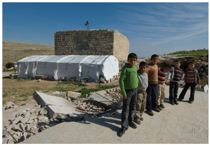
On 10 January, Israeli forces demolished the homes of more than 100 Palestinians, as well as the village school; since then students have been attending classes in a tent.

In the West Bank, many of these vulnerable communities are located in the Jordan Valley and in the eastern slopes of the Bethlehem and Hebron governorates, where large tracts of land have been declared closed by the Israeli authorities for military training. In one such community, Khirbet Tana (Nablus), the Israeli military demolished 16 structures, including a school serving 40 children, thus displacing 100 of its 250 residents. Families living in three other communities located in "closed military zones" received eviction orders during January, placing 76 people at risk of displacement. In another Bedouin community in the Jordan Valley (Ka'abneh), the primary school