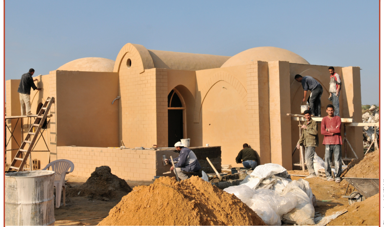
UNRWA is constructing shelters made of compressed earth blocks (CEB) to house 200 refugee families displaced in operation Cast Lead.

According to UNRWA's latest survey, 200 refugee families are still living in tents or makeshift shelters without proper roofing, windows or doors. In response, UNRWA has launched a project to construct temporary shelters made of compressed earth blocks (CEB). The blocks, made of compressed soil which is plentiful in Gaza and taken from existing quarries, are robust, durable, ecologically friendly and thermally efficient.