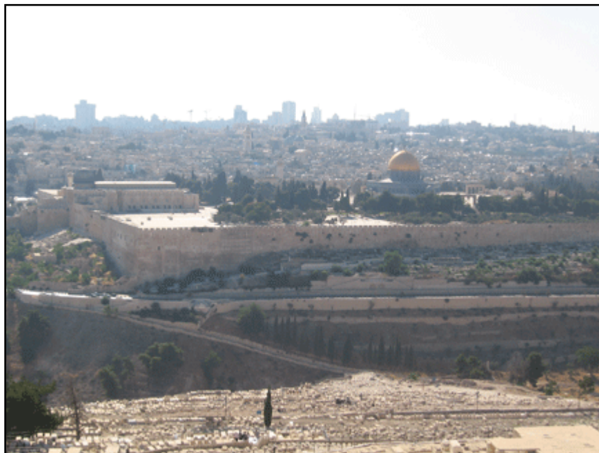
Jerusalem.

response. Yet this same response is ineffective against the broader systemic issues of the conflict, raising questions about the extent to which a humanitarian response has facilitated the occupation by not allowing the situation to get “bad enough” to force a political settlement. It also raises questions about the ability of the