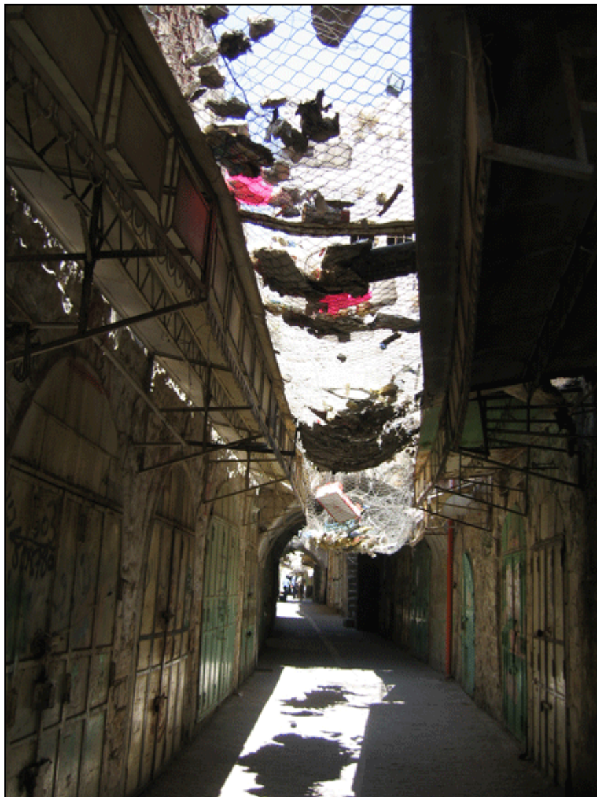
Closed Palestinian stores in H2, the Israeli-controlled area of Hebron.

our future.” Palestinian freedom of movement, even within the West Bank, is restricted by various mechanisms: earthen barriers, ditches, trenches, gates and terminals between Israel and the West Bank. 5 In