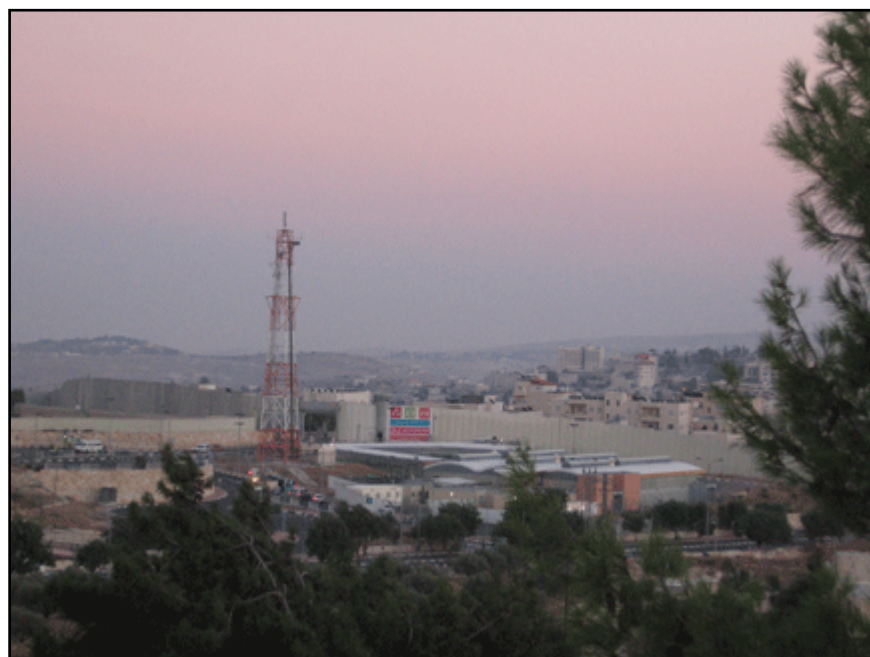
Israeli checkpoint from Jerusalem to Bethlehem.

In terms of universality, then, the clash between principles appears to rest more with questions about the extent to which humanitarian actors should engage in solidarity rather than the cultural baggage of western aid or some of the "insider/outsider" dynamics present in some of the other HA2015 case studies (Donini et al. 2006). As noted above, there is a tradition of assistance within Islam (e.g., zakat ) and it is well-known that Hamas has long provided a social safety net for Palestinians in the oPt. 17 These non-western and Islamic sources are important in the overall picture of assistance to Palestinians. Both the scale of and entitlement to western assistance remain crucial, despite Palestinian dissatisfaction and anger with the lack of a political settlement (see below under "Coherence" for more on this topic). In other words, any erosion in the social contract of the acceptability of aid is not so much due to a difference between western and non-western values, but instead to not doing enough—or perhaps more accurately, not being perceived to be doing enough—to address the asymmetry and structural nature of the conflict that makes aid necessary.