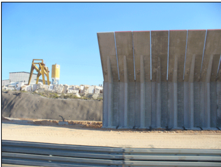
West Bank barrier, in progress.

Many of the humanitarian actors interviewed for this research admitted a sense of discomfort (and some resignation) with the idea that their work indirectly or directly allowed Israel to shirk its responsibilities under international humanitarian law (IHL) to provide for the Palestinian population that lives under Israeli occupation. 22 As a result, the central humanitarian issues are access and protection. The band-aid critique is not new or unique to the oPt, nor is it likely to disappear without a comprehensive peace agreement. As one interviewee summed