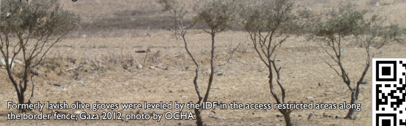
Formerly lavish olive groves were leveled by the IDF in the access restricted areas along the border fence, Gaza 2012

The large majority of the olive trees that existed in areas within 1.5 km from the perimeter fence were destroyed in recent years by the Israeli military. Farmers refrain from replanting these areas due to the weekly leveling incursions and the risk of receiving 'warning shots' when approaching the area.