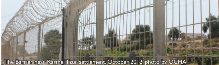
The Barrier near Karmei Tzur settlement, October 2012

Similarly to more than 50 other settlements, the outer limits of Karmei Zur settlement encompass over 100 dunums of private land cultivated by Palestinians. Access to this area is restricted by a 'prior coordination' regime which undermines agricultural livelihoods.