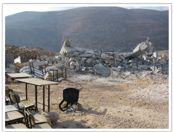
Remains of the Khirbet Tana school, demolished by Israeli forces in December 2010.

On 9 February, Israeli forces demolished six residential structures and 21 animal pens in the community of Khirbet Tana in the Nablus governorate. These demolitions displaced six families (52 people) and affected a total of 106 people. This is the third time since January 2010 that the community has experienced wide-scale demolitions, and the fourth time since 2005. Humanitarian organizations are currently working on assessing basic needs and providing an emergency response.