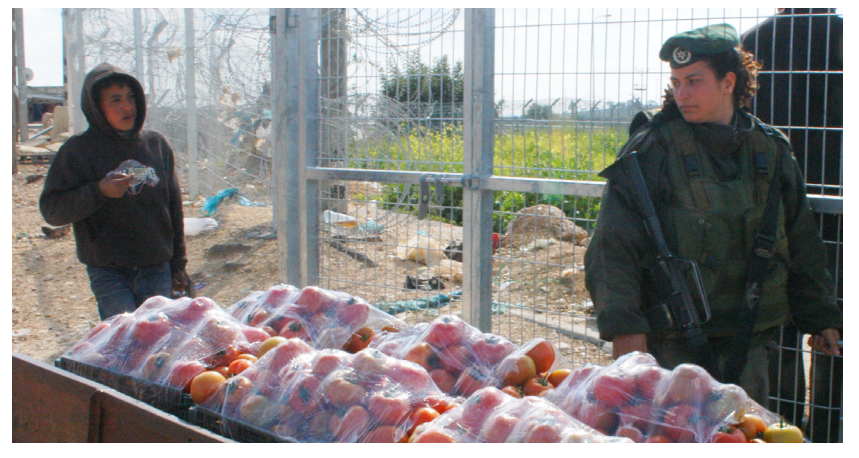
A Palestinian child trying to cross the new Barrier Gate at Azzoun Atma.

Abroad Department (RAD) on 22 March by the Hamas authorities in Gaza, the Ministry of Health (MoH) in Ramallah stopped the approval and funding of newly processed applications. Without