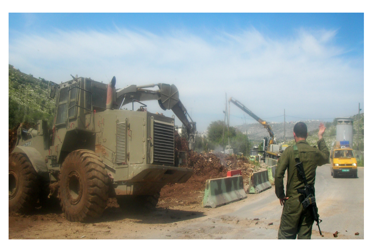
IDF Expansion of Enav checkpoint, Tulkarm. Photo taken in March 2009.

The month of February recorded important developments in internal movement and access within the West Bank. Most of these developments contribute to the easing of Palestinian movement in specific areas, particularly for vehicles, but preserve and entrench existing Israeli restrictions and mechanisms of control for the benefit of Israeli settlements.