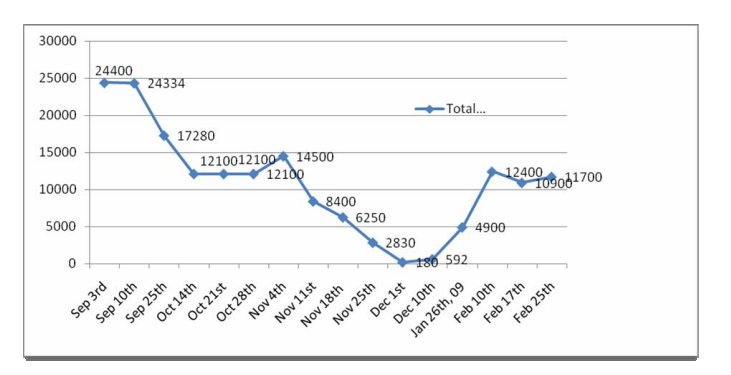
Chart I: Weekly total wheat flour stocks at Gaza mills from September 2008 to February 2009

Nahal Oz fuel pipeline was open on 18 days in February compared to 11 days in the previous month, allowing an increase in the amounts of cooking gas and industrial fuel entering Gaza. While the supply of cooking gas is still far