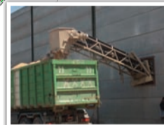
Karni Crossing conveyor belt

Closed since June 11, 2007. External conveyor belt operational two days a week. Cement lane completely closed since Oct 29, 2008.