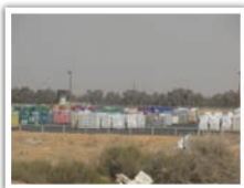
Kerem Shalom Crossing

Partially open for the movement of a number of authorized persons, Palestinian medical and humanitarian cases.