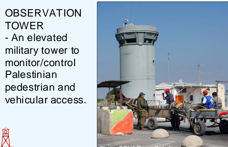
OBSERVATION TOWER - An elevated military tower to monitor/control Palestinian pedestrian and vehicular access.

PARTIAL CHECKPOINT - An established checkpoint operating periodically.