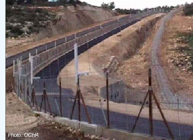
Electronic Fence Barrier