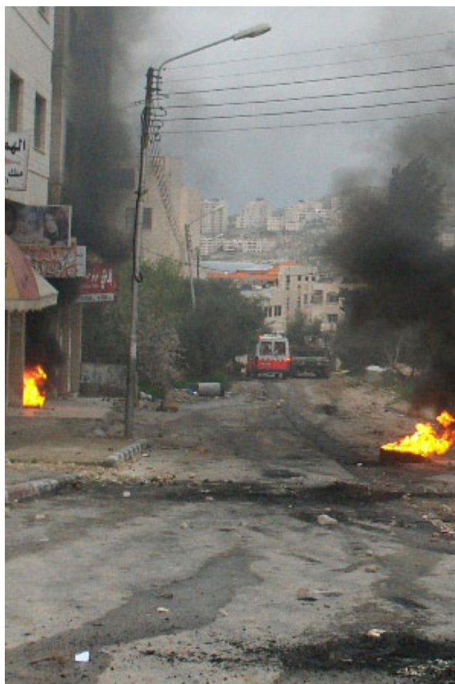
Entrance to Radifiya hospital Nablus February 2007

Electricity was cut briefly during the initial incursion but restored by the municipality and electricity and water services functioned throughout. Three homes were reported damaged, and one completely demolished. One coffeehouse was burnt in addition to a house in Makhfiya area outside the Old City during an IDF operation on 26 February. According to the IDF, damage was caused when the army detonated explosives found in the buildings. Many buildings in the Old City also suffered minor structural damage.