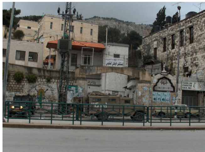
Entrance to Al Wattani hospital Saad Abdel Haq - OCHA / Nablus February 2007

Health centres within the Old City are closed but emergency committee health teams are attempting to circulate to address immediate needs.