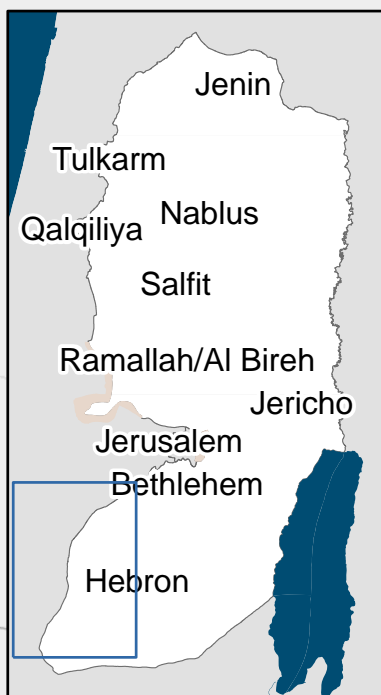
Comparing situations Pre-Intifada and August 2005

Palestinians without permits (the large majority of the population)