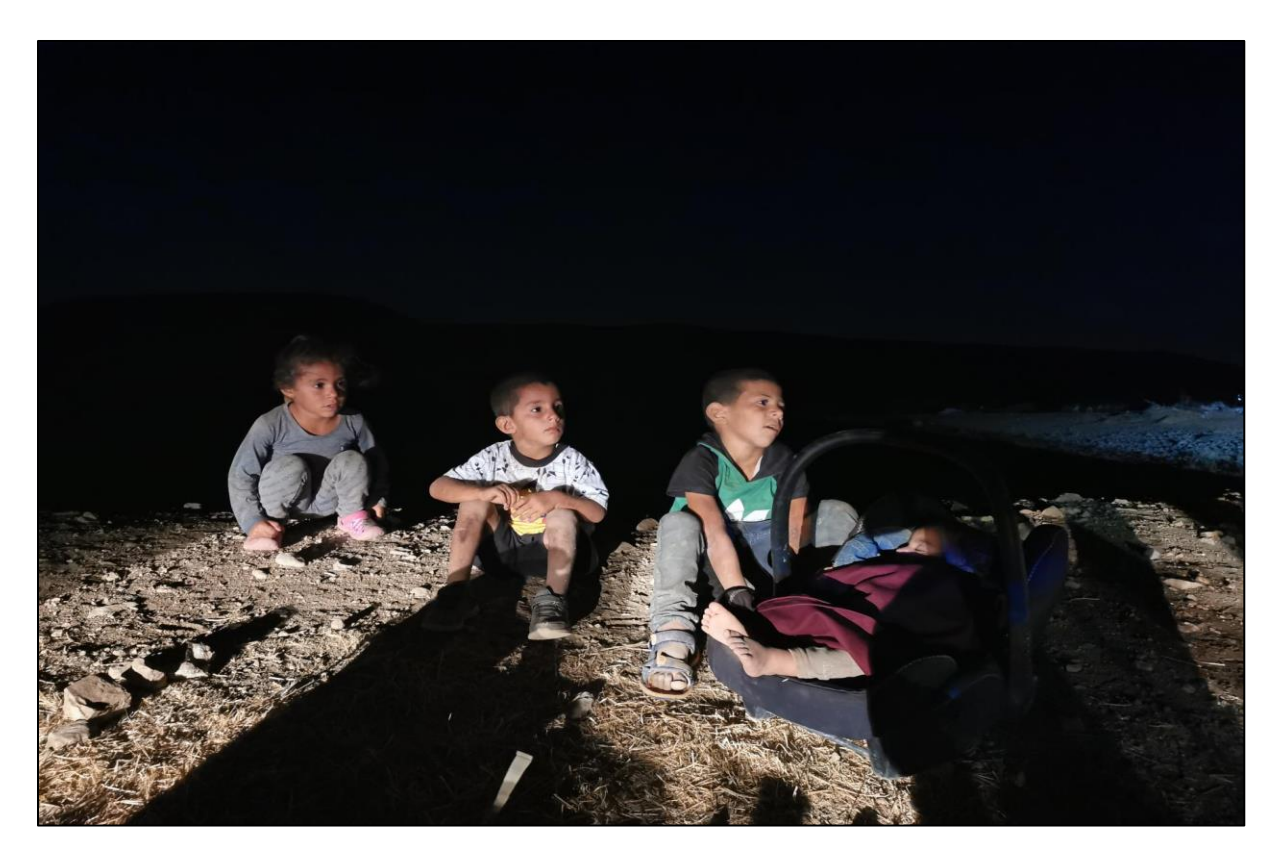
Children from Humsa - Al Bqai'a left out in the open as night falls following the demolition of their homes and confiscation of their belongings by Israeli forces., 7 July 2021.

For additional information on the deteriorating humanitarian situation in Humsa - Al Bqai'a, please see the previous five Flash Updates issued in February 2021.