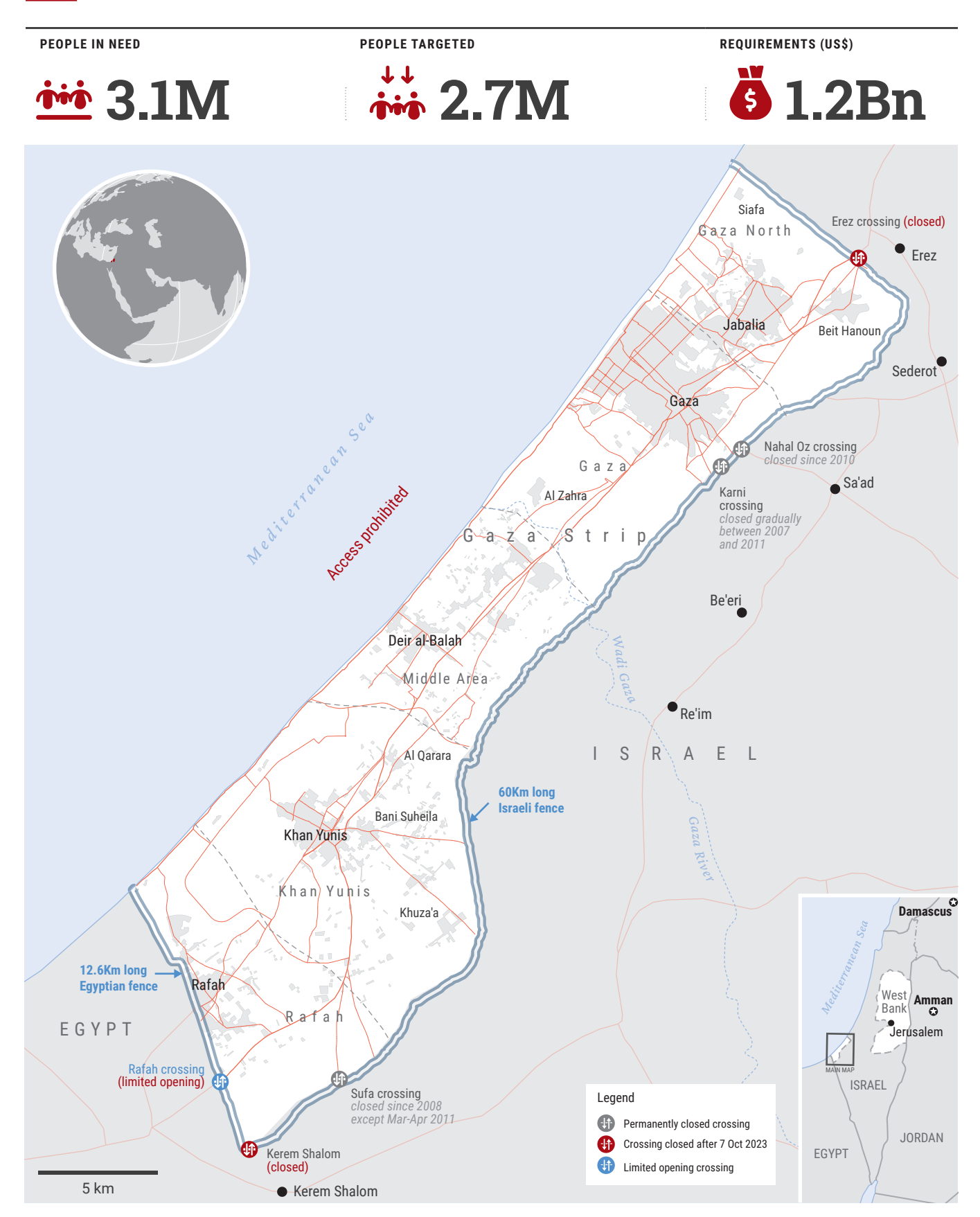
The designations employed and the presentation of material on this map do not imply the expression of any opinion whatsoever on the part of the Secretariat of the United Nations concerning the legal status of any country, territory, city or area or of its authorities, or concerning the delimitation of its frontiers or boundaries. Sources: ESRI, OCHA, OSM, UNGIS.