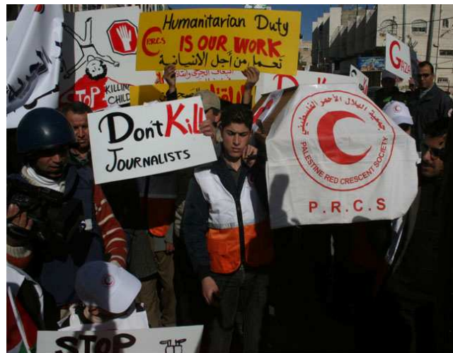
Palestinian demonstration against targeting protected groups.

During the first quarter of the year 2009, the Israeli Army, private security guards and Israeli settlers continued their violations against PRCS medical personnel, premises and vehicles, while on humanitarian duty searching for, removing and transporting of wounded and sick. These measures impede PRCS humanitarian mission, causing a negative impact on the health situation of patients and wounded persons.