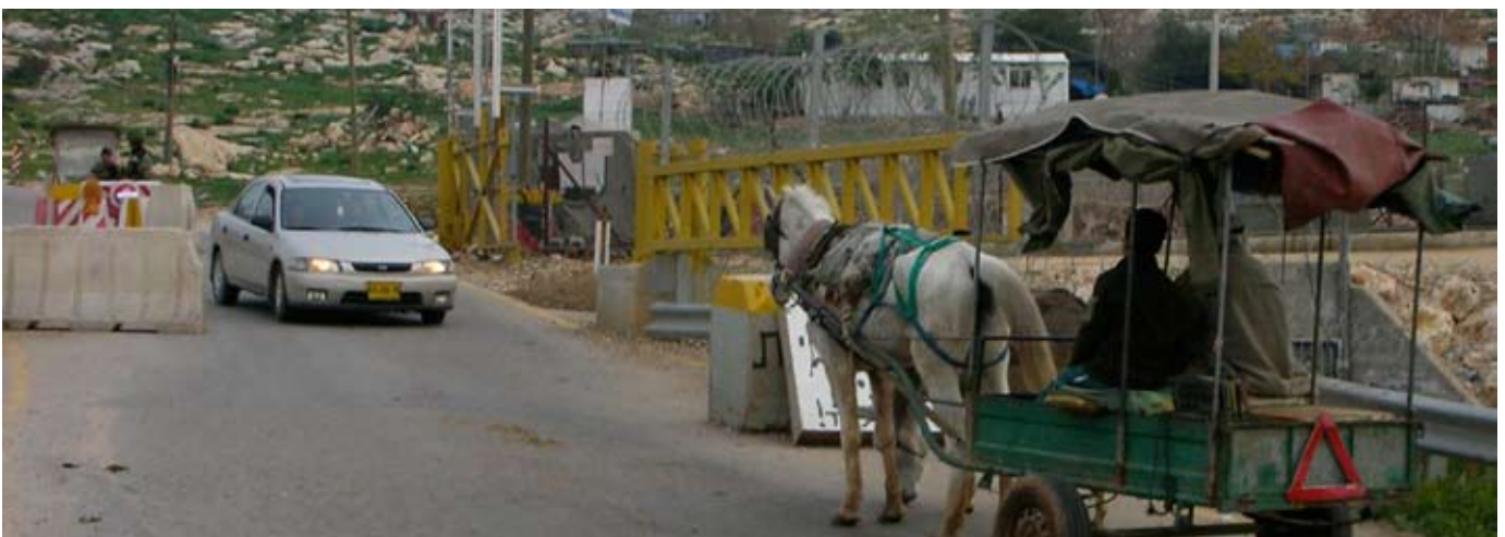
'Azzun 'Atma Gate: A farmer waits for a settler's car to cross before he faces the gate and has his permit checked.

There are plans for an additional inner barrier which will isolate 'Azzun 'Atma from the surrounding settlements and cut off significantly more agricultural land.