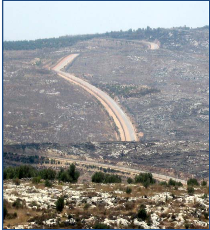
The wall on the south-eastern side of the village

The Wall now runs 6.5km around the village and ranges between 500m and 1km inside the Green Line, destroying the rest of the Rantis agricultural land and turning the village into an enclave, surrounded it by Wall and full Israeli control in the main village entrance.