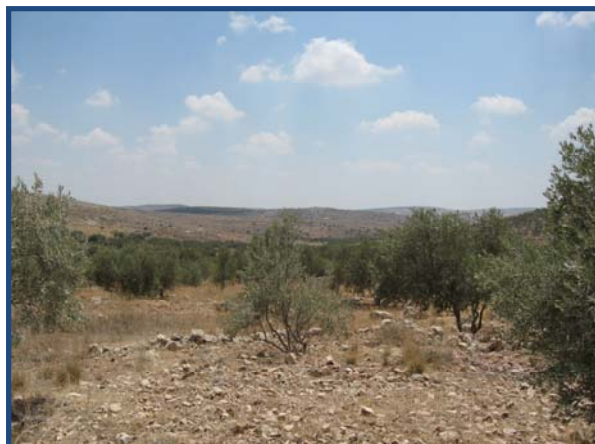
Agricultural land confiscated and declared as military zone