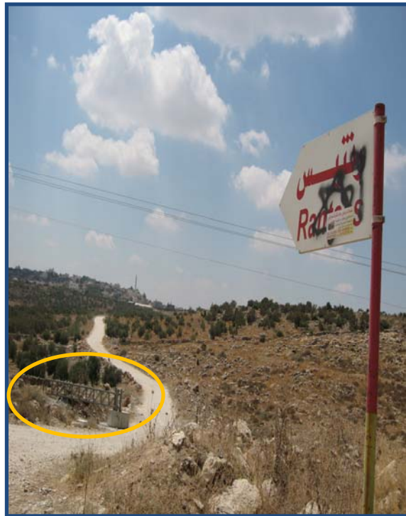
The gate (in ellipse) placed by the occupation on the alternative unpaved entrance

There have already been several instances of denied access and entry into and out of the village, causing severe consequences. Some women in the village have been forced to give birth while waiting at the checkpoint. In 2002, a young man died at the Rantis checkpoint (located on the village entrance) after being denied passage to receive emergency medical care in Ramallah.