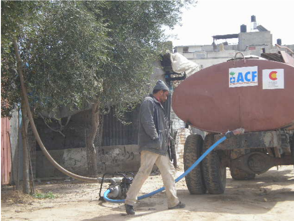
Water trucking distribution in Ezbit Abed Rabo area – North of Gaza (05/03/09)