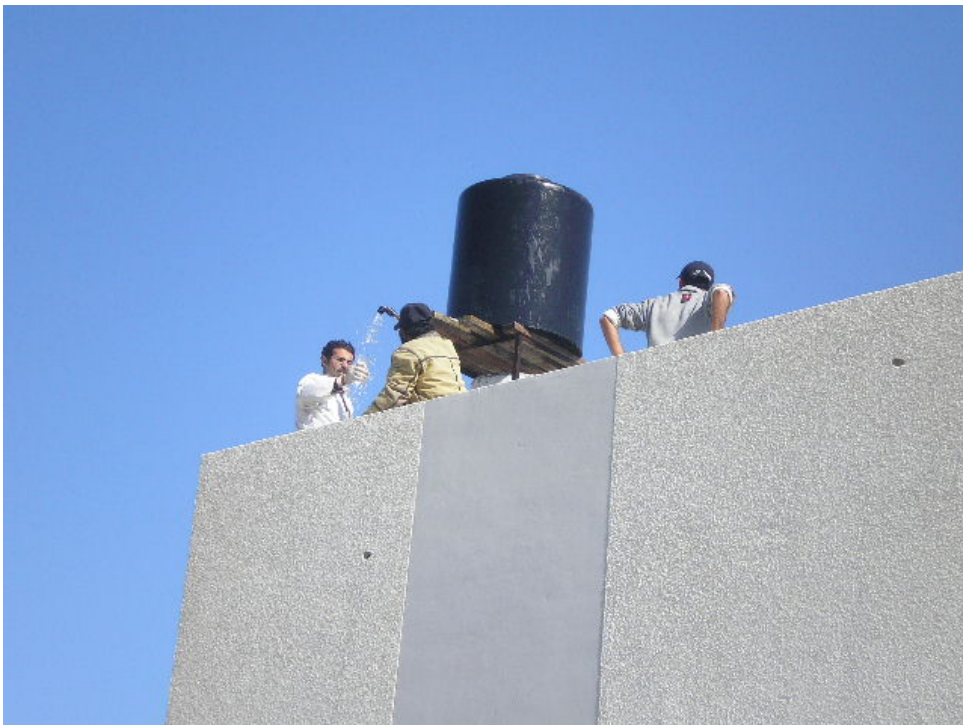
The Lab taking water samples from household roof tank in Ezbit Abu Rabo area - Jabalia (28/02/09)