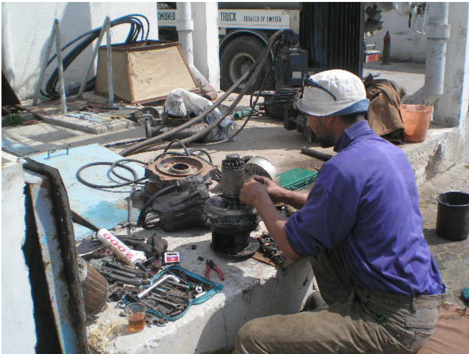
Cleaning and repairing of Al Alami sewage pumping station – Jabalia (10/03/09)