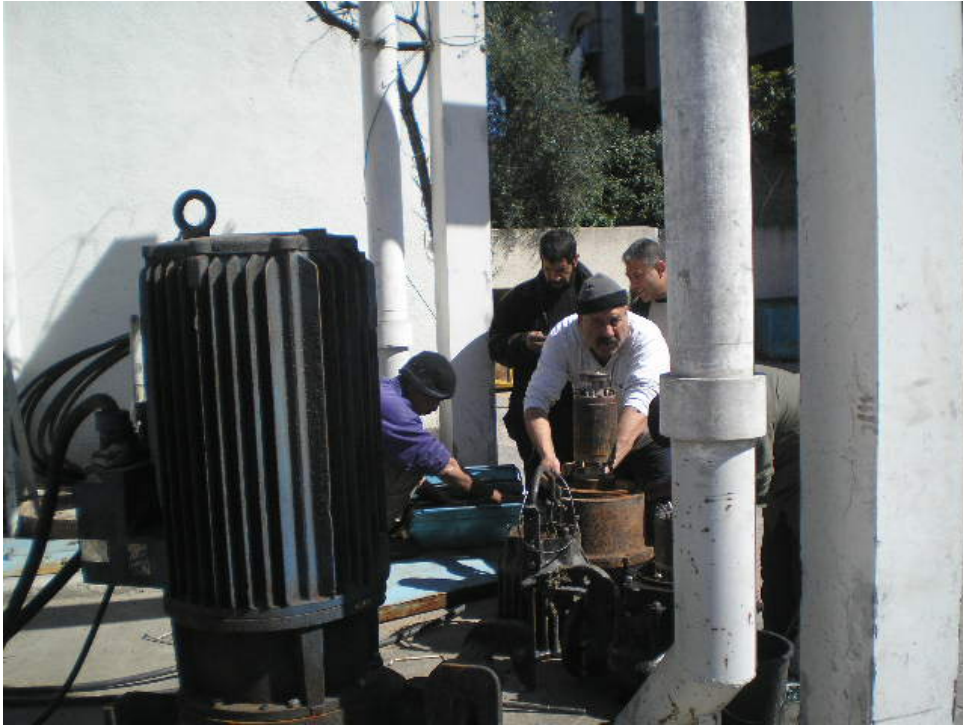
Emergency cleanup and repairing of Pumps in Abu Rashed sewage pumping station in Jabalia (07/03/09)