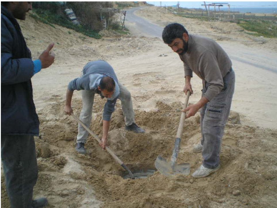
Sewage network repair and cleanup at Anan area in Jabalia (10/03/09)