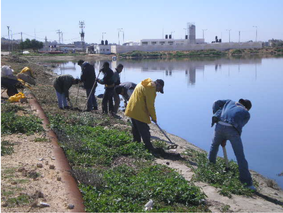
Operation of the repaired wastewater lagoon at Gaza wastewater treatment plant– (09/03/09)