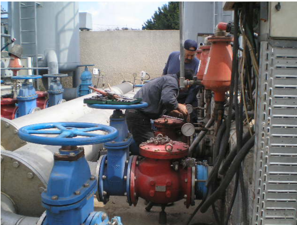
Cleaning and repairing of air release valve in Abu Rashed sewage pumping station in Jabalia (31/03/09)