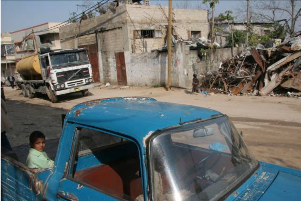
Water trucking distribution in Ezbit Abed Rabo area – North of Gaza (20/03/09)