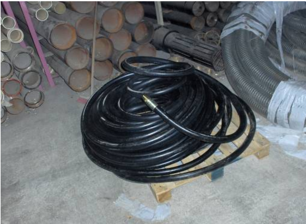
Materials which have been delivered to the CMWU store in Gaza – (Jetting hoses and Transparent sewage pipes of 4 inches diameter (23/03/09)