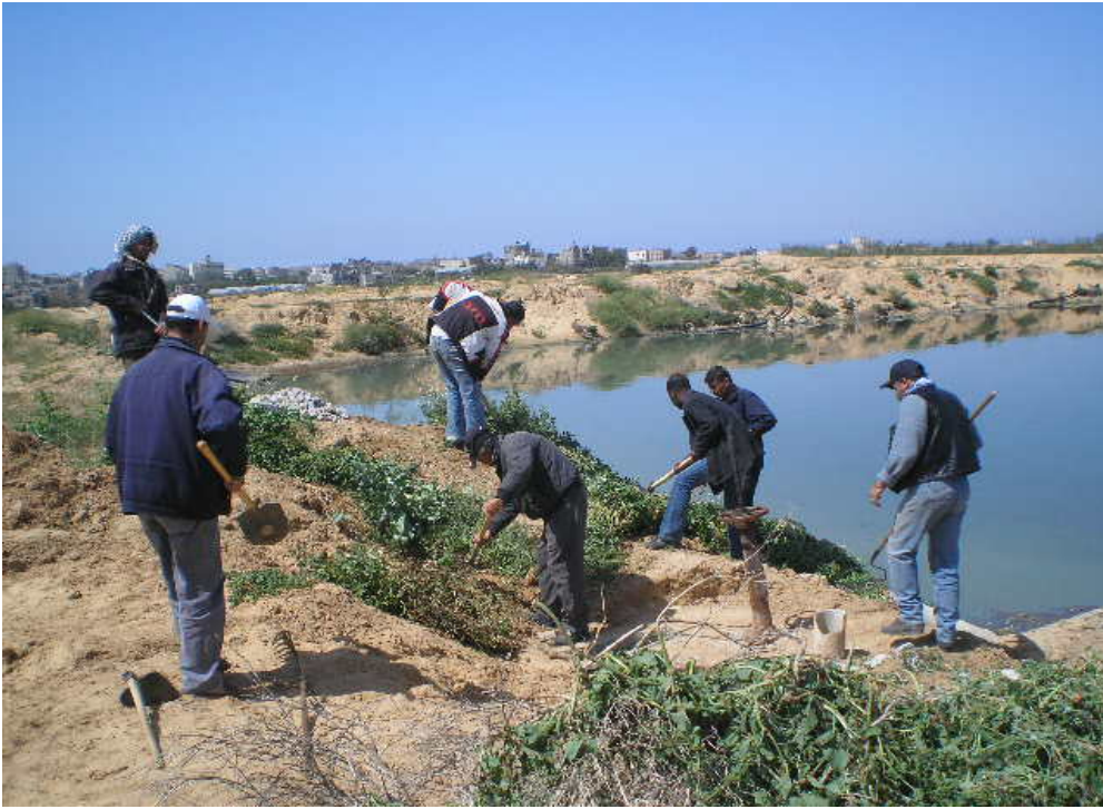
Repairing pumps in Abu Rashed pumping stations in Jabalia (31/03/09)