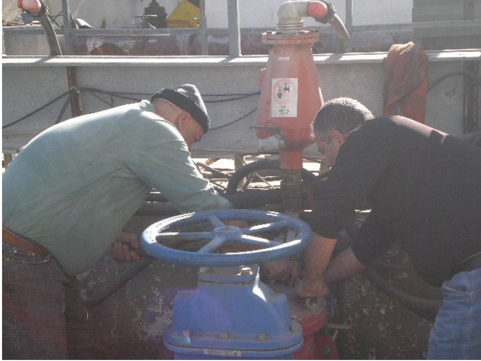
Emergency cleanup of sewage in Jabalia AbuRashed Pump Station (04/02/09)