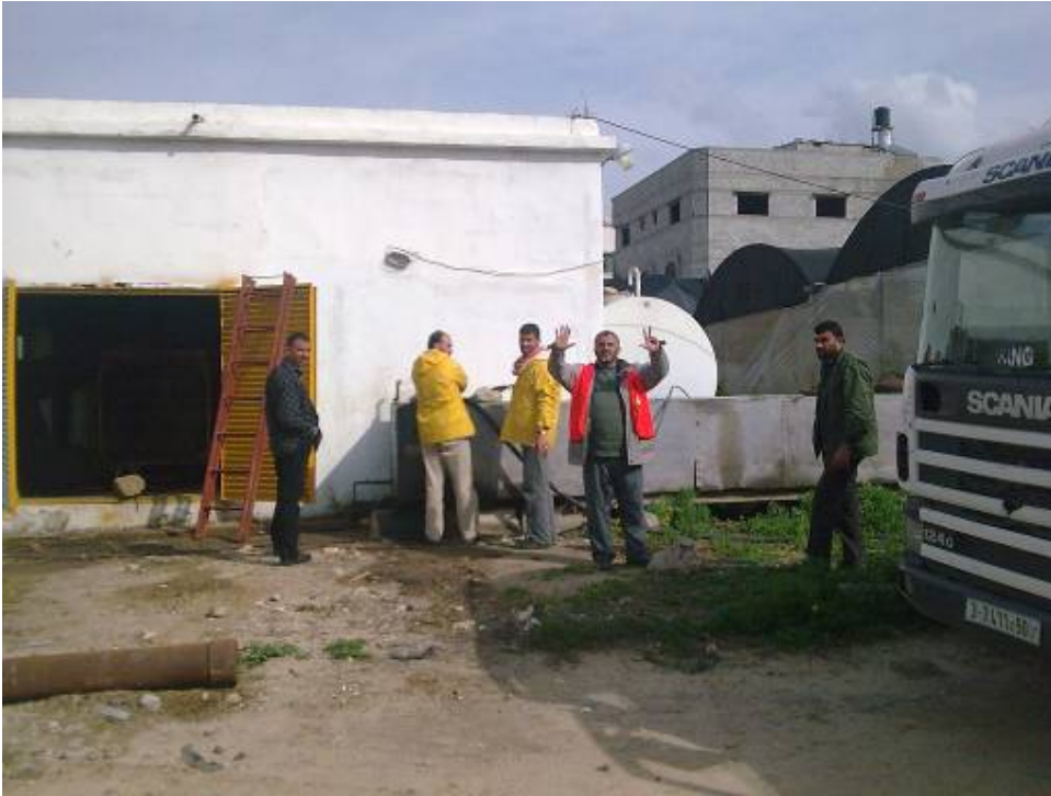
Supply diesel fuel in Al Sheikh Redwan well – Gaza city (19/01/09)