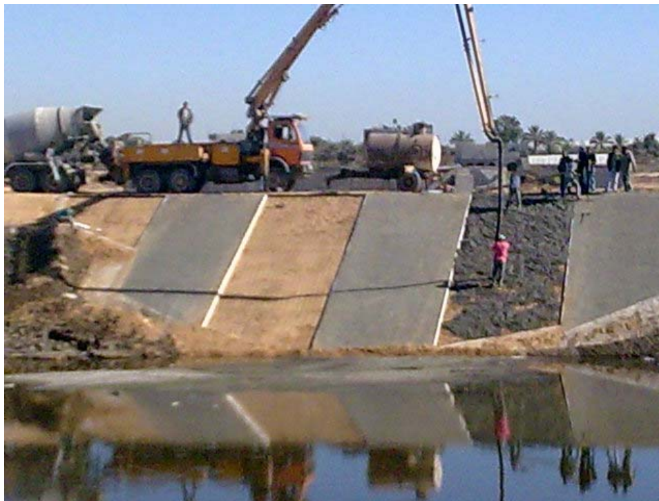
Reinforcement and repair of the sewage lagoons of Gaza City (05/02/09) - During Construction