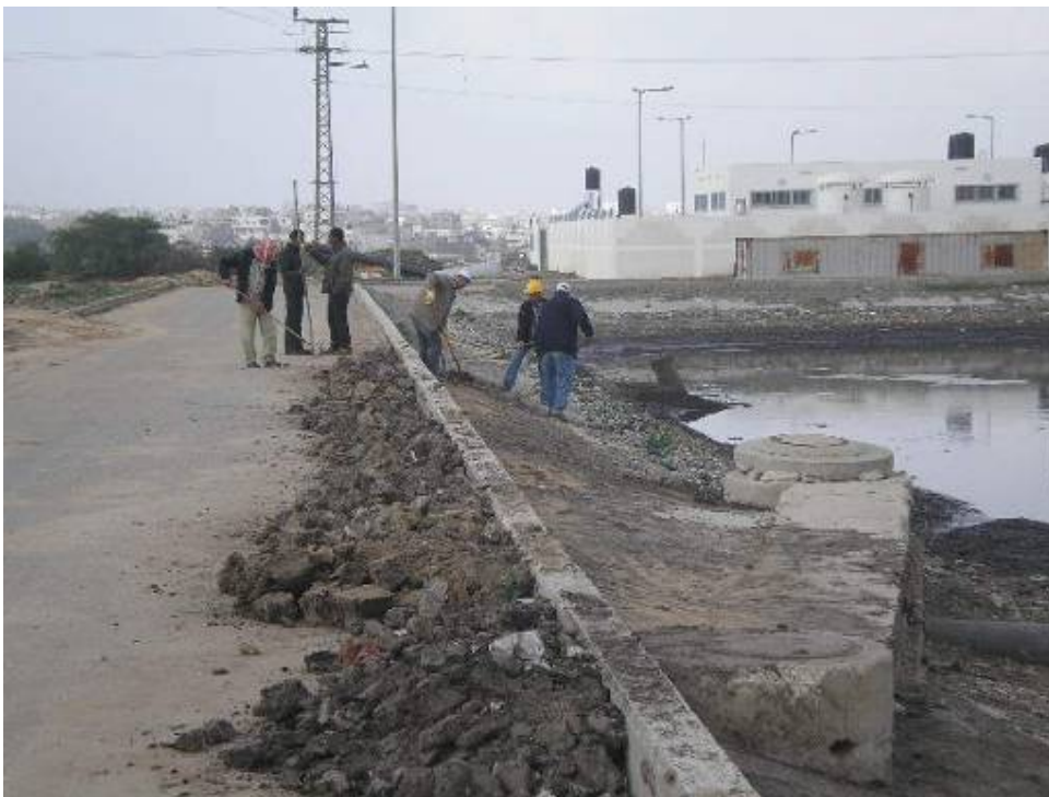
Emergency cleanup of sewage in Beit Lahia wastewater treatment plant (28/01/09)