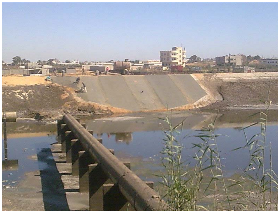
Reinforcement and repair of the sewage lagoons of Gaza City (05/02/09) After Rehabilitation