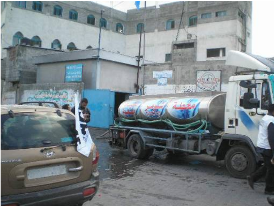
Water distribution in Beach camp UNRWA schools (16/01/09)