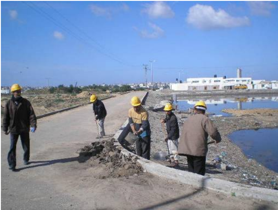
Emergency cleanup of sewage in Beit Lahia wastewater treatment plant (28/01/09)