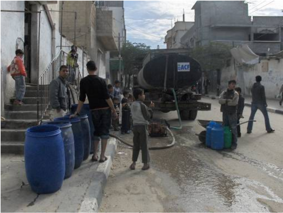
Water distribution in Abed Rabo area – North of Gaza (14/01/09)