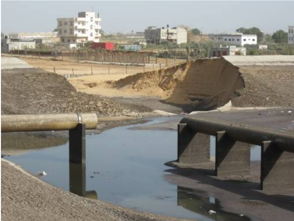
Situation of the sewage lagoons of Gaza City (29/01/09)