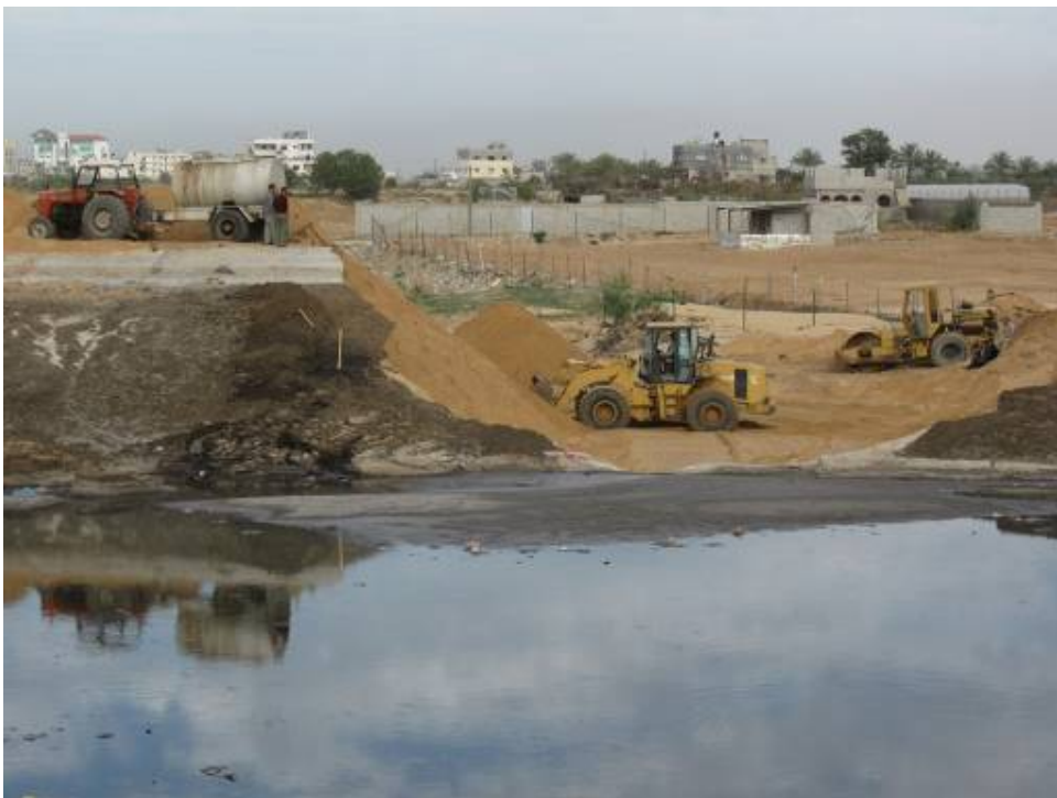
Reinforcement and repair of the sewage lagoons of Gaza City (29/01/09)