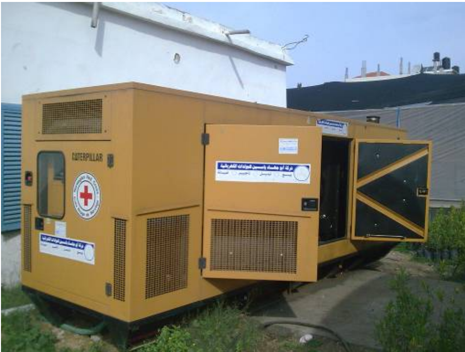
Generator supplied with diesel fuel for a well in Al Sheikh Redwan – Gaza city (19/01/09)