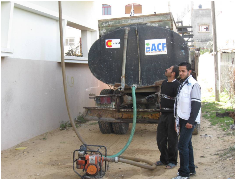
Water distribution in Biet Lahia (27/01/09)