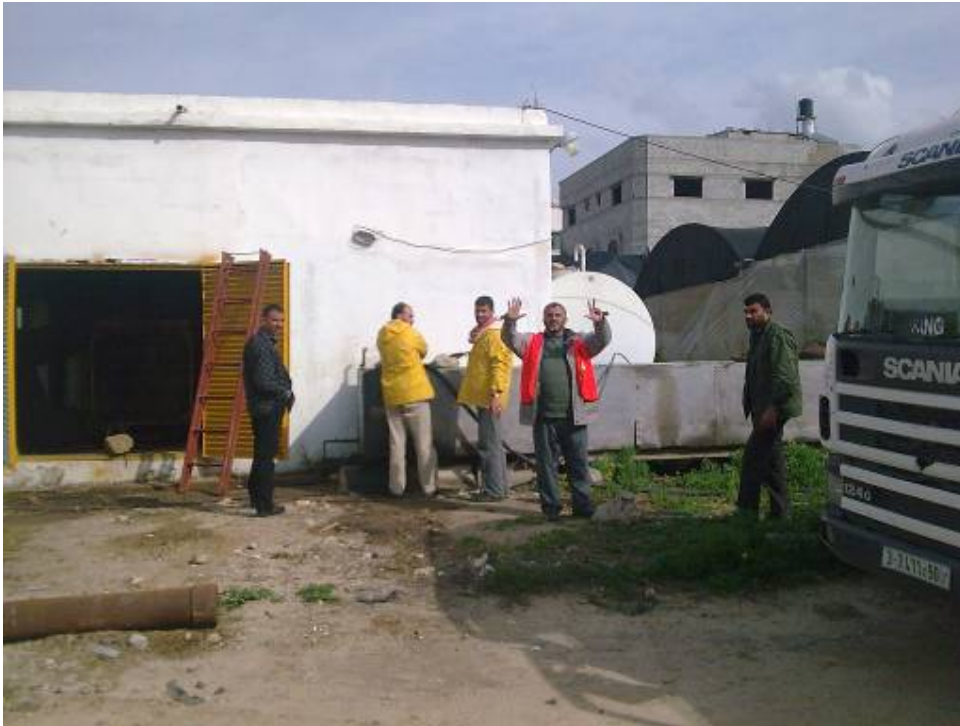
Supply diesel fuel in Al Sheikh Redwan well – Gaza city (19/01/09)