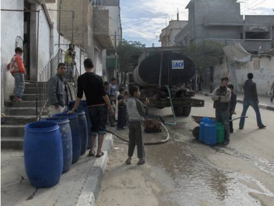
Water distribution in Abed Rabo area – North of Gaza (14/01/09)