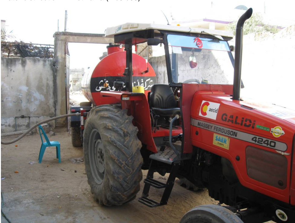
Water distribution in Biet Lahia (27/01/09)