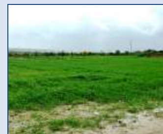
The same site in Nov. '09 and in Jan. '10, two months after the rubble was removed. As reported in the November SitRep, 22 anti-tank mines were found on that site by UNMAT EOD teams during rubble removal by UNDP.