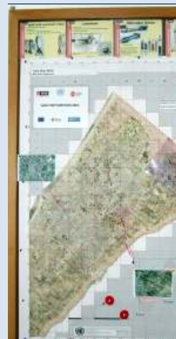
Close-up of a map of northern Gaza used at the UNMAT-GO Office for planning and analysis purposes.