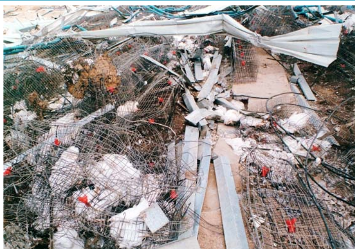
Figure 2 Destroyed poultry farm in Gaza Strip as a result of Operation Cast Lead

While the military operation was still unfolding with its outcome uncertain, stakeholders called for a unified voice among the sector to bring attention to the suffering of the agricultural community in the Gaza Strip. As the crisis unfolded and damage assessments were available, they became increasingly aware of the importance to highlight damages incurred during the operation, in addition to the ongoing impact of the closure. The sector developed an advocacy paper (see Annex A) that describes and outlines ways to overcome the major challenges faced by the sector.