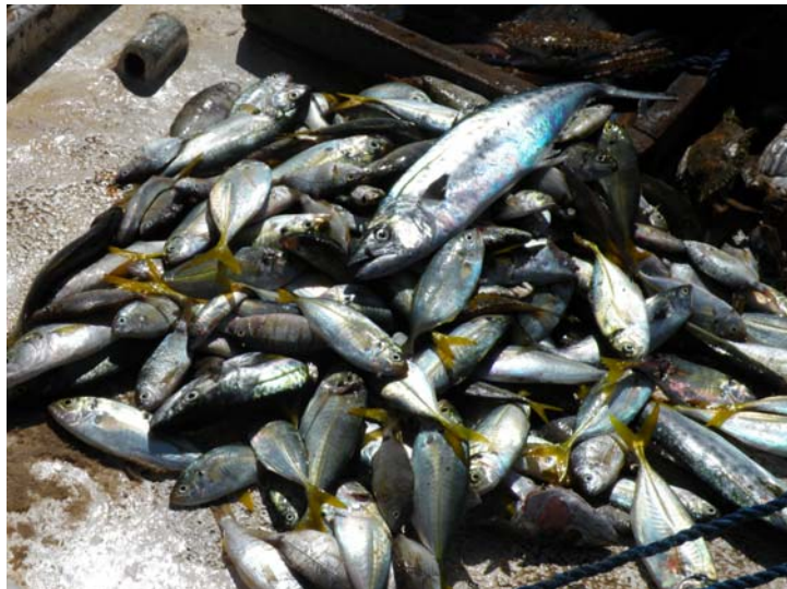
Figure 3 Fishing activities in Gaza Strip

As a result of coordinated efforts, the sector is prepared to address the needs of the agriculture community in Gaza. Yet major obstacles prevent proper relief, rehabilitation and reconstruction efforts. In addition to the substantial funding necessary to revitalize the sector to its once productive and vibrant era, the borders must be opened to allow for free trade, especially the export of agro-products, and import of agricultural inputs (raw materials) and dependable import of food commodities that cannot be grown in the Gaza Strip. A sufficient supply of cash is also necessary for reviving market activities, both on the micro- and macro-levels. Priority interventions for the sector are listed below, and categorized by urgency.