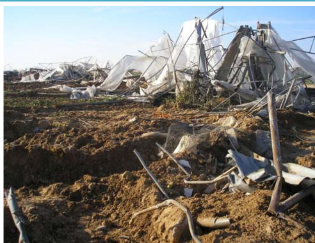
Figure 1 Destroyed greenhouses in Gaza Strip as a result of Operation Cast Lead

During the military operation, sector stakeholders responded swiftly to the crisis by executing a multi-agency rapid needs assessment, proposing USD 29 million in immediate relief to the sector via the Flash Appeal for Gaza, developing an early recovery strategy in collaboration with the United Nations Development Programme (UNDP) and the Palestinian Authority (PA), prioritizing interventions, advocating for the sector and monitoring agricultural goods availability in Gaza. In light of the damage assessment results, the funds requested in the Flash Appeal cover only a minor portion of the needs, leaving a shortfall of USD 150 million . The sector has the capacity to recover from the crisis provided the right conditions are in place. These include: a) an opening of the commercial crossings to allow for free movement of goods and a resumption of trade activities that have been suspended since June