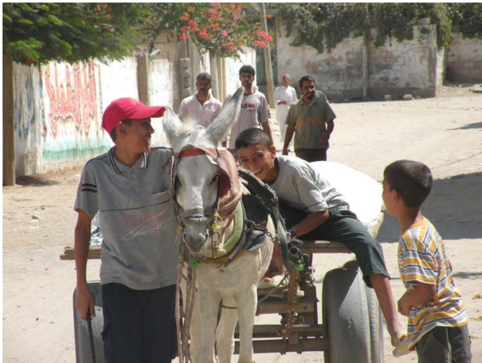
Figure 4 Children in Gaza Strip

Already suffering from a lack of interventions owing to the ongoing closure, the added damages absorbed during Operation Cast Lead has weakened the agriculture sector severely. In total, the sector's preliminary assessment estimates that at least USD 180 million is needed to restore the sector to its pre-27 December levels. Another USD 88 million will recover indirect losses incurred for the initial six-month period following the 23 days of attacks. Despite the high cost of funding necessary to revitalize the sector, even greater change in the political situation is required for agriculture to realize its full potential.