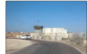
OBSERVATION TOWER: An elevated military tower to monitor/control Palestinian pedestrian and vehicular access.