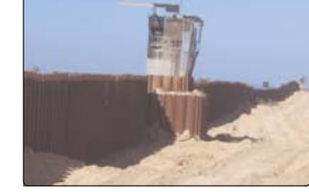
METAL BARRIER Boundary between Gaza and Egypt.