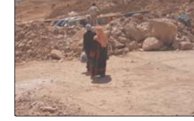
EARTH MOUND: A mound of rubble, dirt and/or rocks used to obstruct vehicle access.