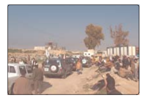
CHECKPOINT: A barrier manned by IDF and/or Border Police used to control pedestrian and vehicular access.