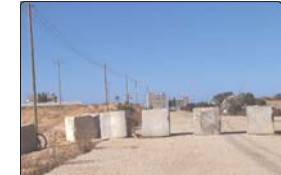
ROADBLOCK: A series of 1 metre high concrete blocks used to obstruct vehicle access.