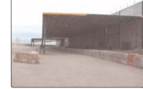
COMMERCIAL CROSSING POINT: Off-loading and up-loading of commercial goods and workers' crossing. RAFAH CROSSING POINT: Main entry & exit point into Gaza for Palestinian civilians other than workers.