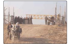
ROAD GATE: A metal gate, often manned by IDF, used to control movement along roads.