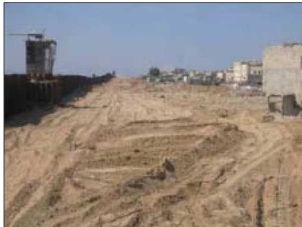
Rafah, Southern Gaza border with Egypt: Much of the open strip was formerly housing.

Infrastructure damage and associated financial loss is enormous. Rafah governorate estimates that the IDF has bulldozed or confiscated 835 acres (3,343 dunums) of land with the loss of citrus fruits, olives, flowers and vegetables. The sealing-off of the Al Mawasi enclave for the last 3 years has deprived Rafah of produce from some of the most fertile Gaza land.