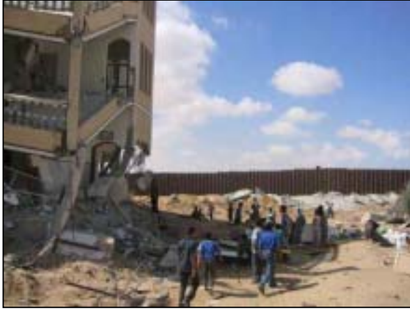
Rafah, Southern Gaza: House Demolition near the Egyptian border.

These measures, together with the closure of Gaza Airport, prolonged closures at the Rafah passenger terminal with Egypt and the destruction and closure of over 210 stores and workshops around the area of Salah el Din gate have contributed to over 70% unemployment in the town and surrounding area.