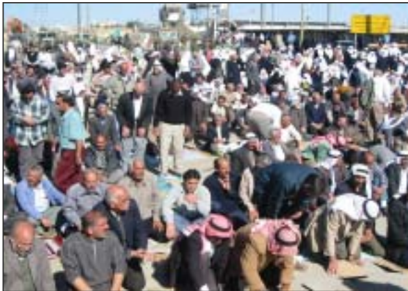
Palestinian worshippers praying at Gilo Checkpoint.

However, European donor recently withdrew its financial support to fund the project. Although the IDF gave verbal approval in October and later in writing, the donor believes the situation is too unpredictable. The situation remains precarious, steadily worsening.