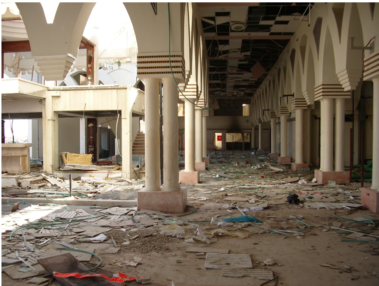
Interior of terminal building, Gaza International Airport, 4 December 2006

The Palestinian Civil Aviation Authority estimates the cost of the recent damage to the terminal, hangars and surrounding buildings at more than $6.4 million and expects this figure to rise significantly when more comprehensive assessments have been carried out. The latest destruction comes in the wake of damages worth $24.3 million to the airport during IDF incursions between 4 and 15 December 2001.