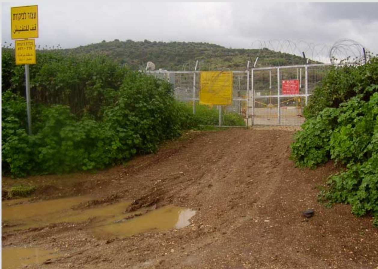
Sahel gate, for access to agricultural land in the Seam Zone. OCHA, 2007

Full text of the ICJ opinion can be found at: http://www.icj-cij.org/docket/index.php?pl=3&p2=4&k=5a&case=131&code=mwp&p3=4