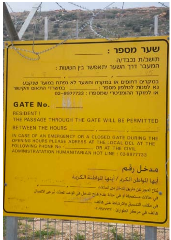
The sign that shows the regulations for using a gate. OCHA, 2007