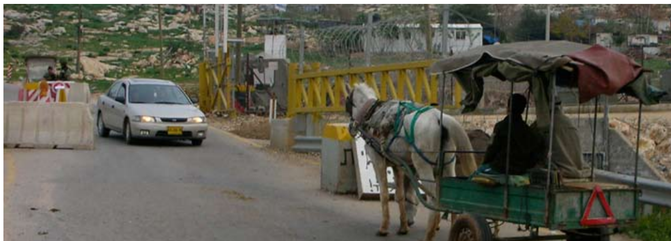
'Azzun 'Atma Gate: A farmer waits for a settler's car to cross before he faces the gate and has his permit checked.

There are plans for an additional inner barrier which will isolate 'Azzun 'Atma from the surrounding settlements and cut off significantly more agricultural land.