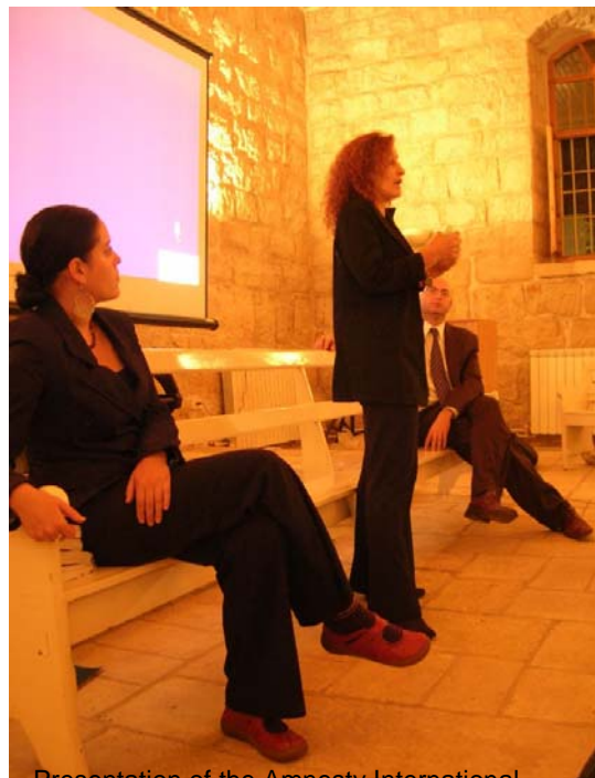
Presentation of the Amnesty International Report in Ramallah on 28 October 2009

The team, both in Gaza and the West Bank has been involved in media work around different events, such as the publication of the AI report,